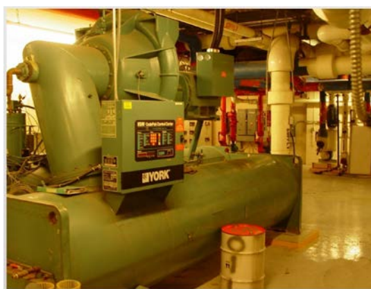
Complete Chiller Plants